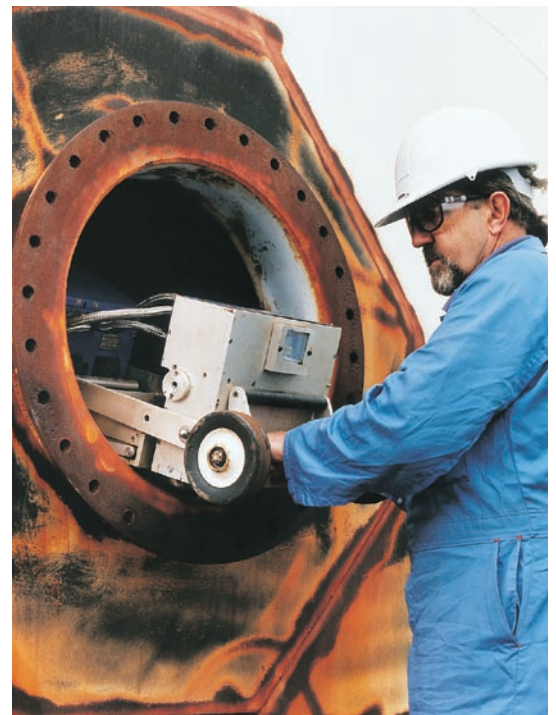
The compact Floorscanner will fit through an opening 600 mm diameter