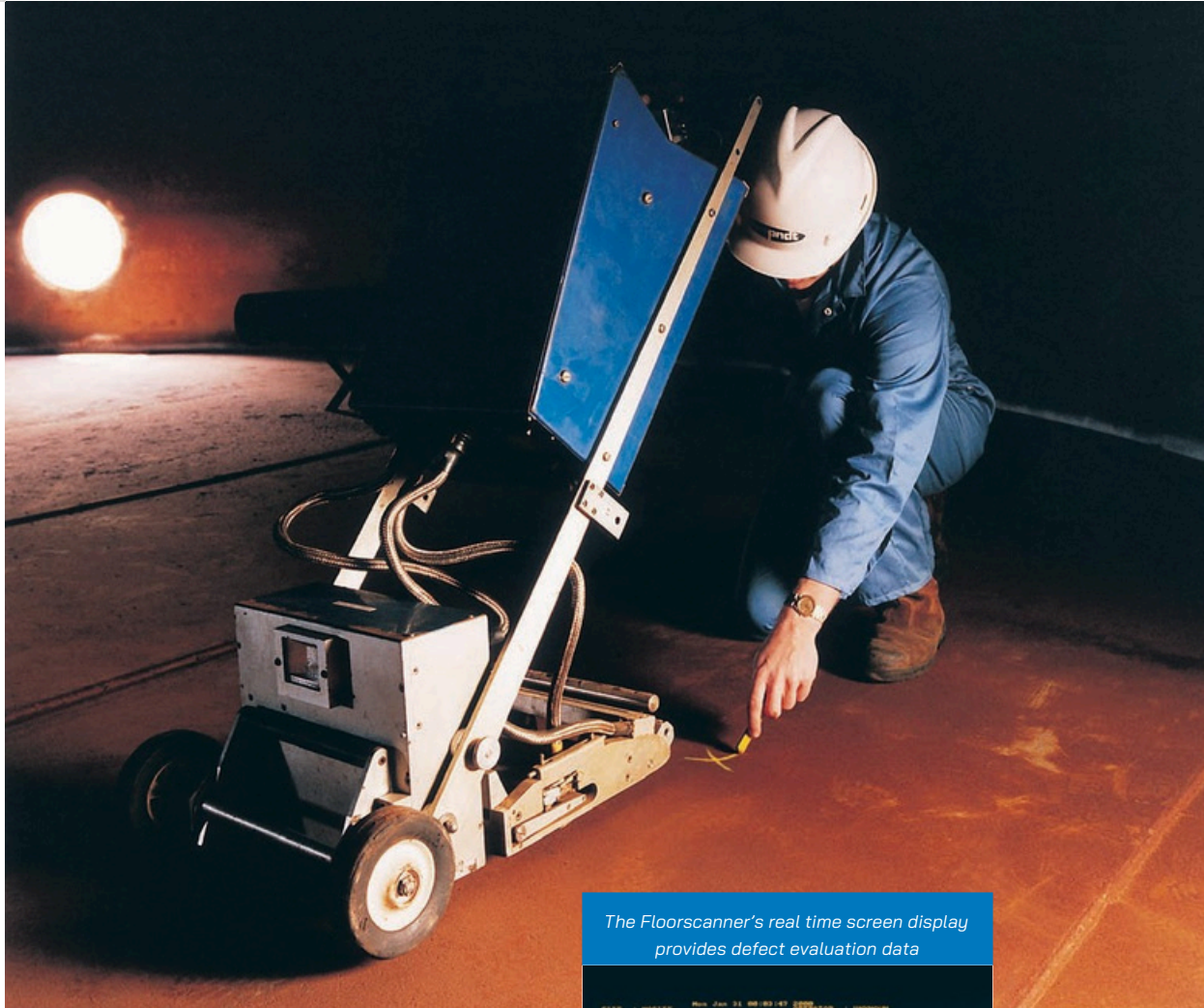
The Floorscanner's real time screen display provides defect evaluation data

A comprehensive service is provided to operators of bulk storage tanks, combining engineering inspection services, non-destructive examinations, reporting and recommendations.